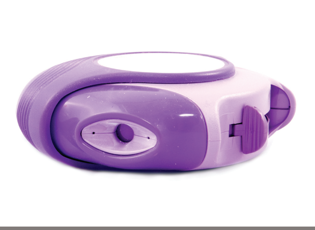
Up to 90 per cent of people with asthma and COPD do not use their inhalers correctly

Health professionals should not assume that patients are being trained by others in inhaler use. Reinforcement of inhaler technique may help optimise drug administration to the lungs and improve disease control. Patients' perception of their inhaler skills has been found to correlate poorly with their ability to use the device correctly.